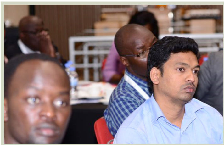
Figure 3. Participant listening intently to the panel discussions

the importance of embracing a strong seed certification system including separating the certifier and implementer roles for quality control. He noted that safeguarding the profitability of the seed business and guaranteed harvests by farmers relies heavily on the adoption of a seed certification protocol that would assure quality seed production to the ultimate benefit of seed companies, multipliers and farmers. Ongoing capacity enhancement on seed system strengthening would be required to promote iteration and continuous improvement.