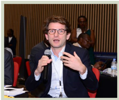
Figure 6: Participants Questions and answer session