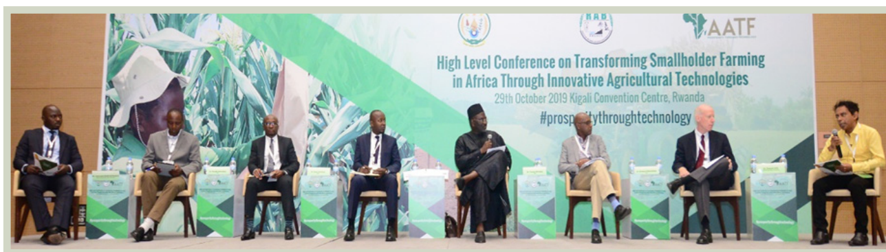
Figure 2. Panelists during the high-level conference

Seven panellists provided insights on selected themes at the moderator's invitation and responded to questions raised by the attendees.