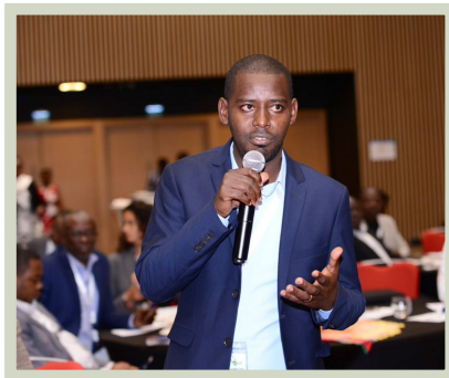
Figure 8: Participants Questions and Answer Session