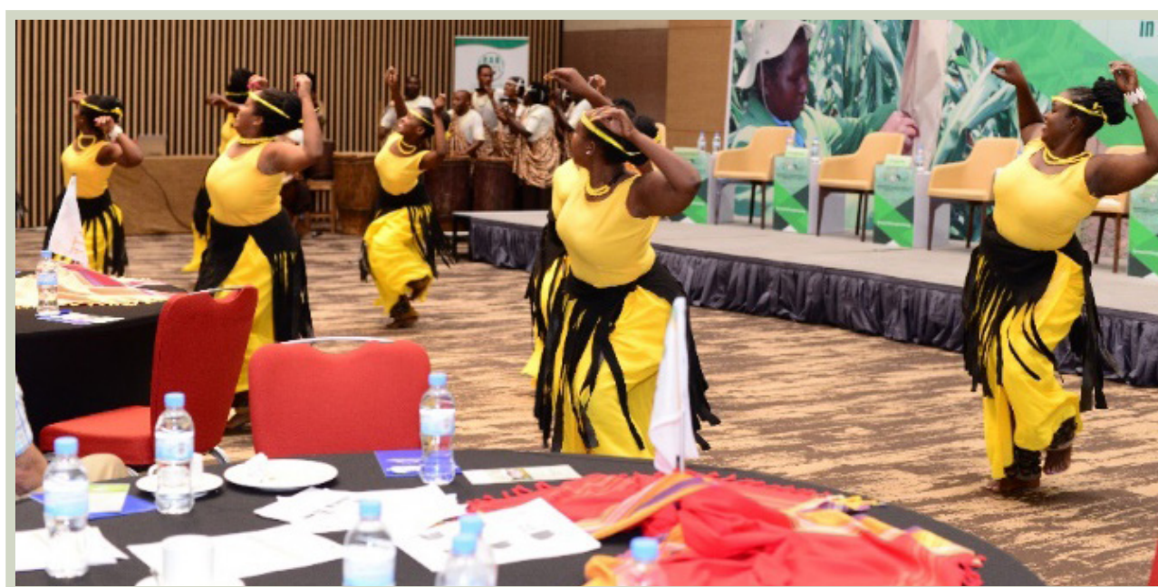
Figure 1. Rwanda traditional dancers during the opening ceremony of the high-level conference

The PS also noted the significant progress Rwanda has made in implementing the Comprehensive Africa Agriculture Development Programme (CAADP), gaining global recognition as one of the best performing countries in implementing the CAADP in Africa. He discussed the country's efforts in developing strategic documents including the 2018 National Agricultural Policy and the Strategic Plan for Agricultural Transformation (PSTA4) that suggest leveraging on agriculture for increased productivity of small scale and traditional farmers and adopting a private sector led agriculture sector.