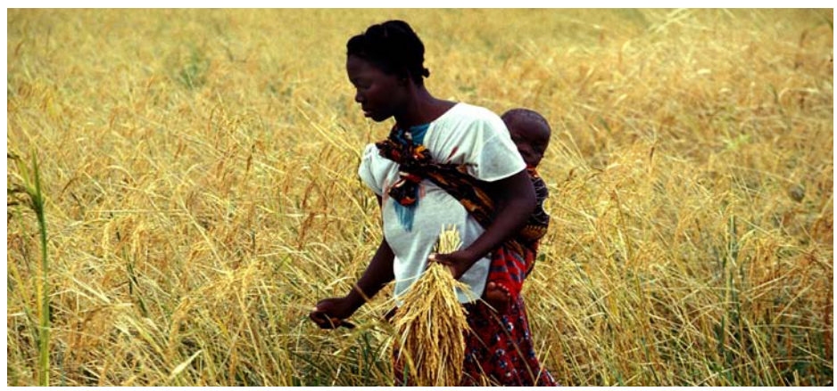
A woman harvests rice: Africa relies heavily on imported rice to meet rising demand for the cereal. The new project will deploy biotechnology to breed nitrogen efficient and salt-tolerant rice for Africa.

lobal rice prices have increased sharply over the past few years, largely due to increasing demand from countries in Africa, the largest importer of the cereal.