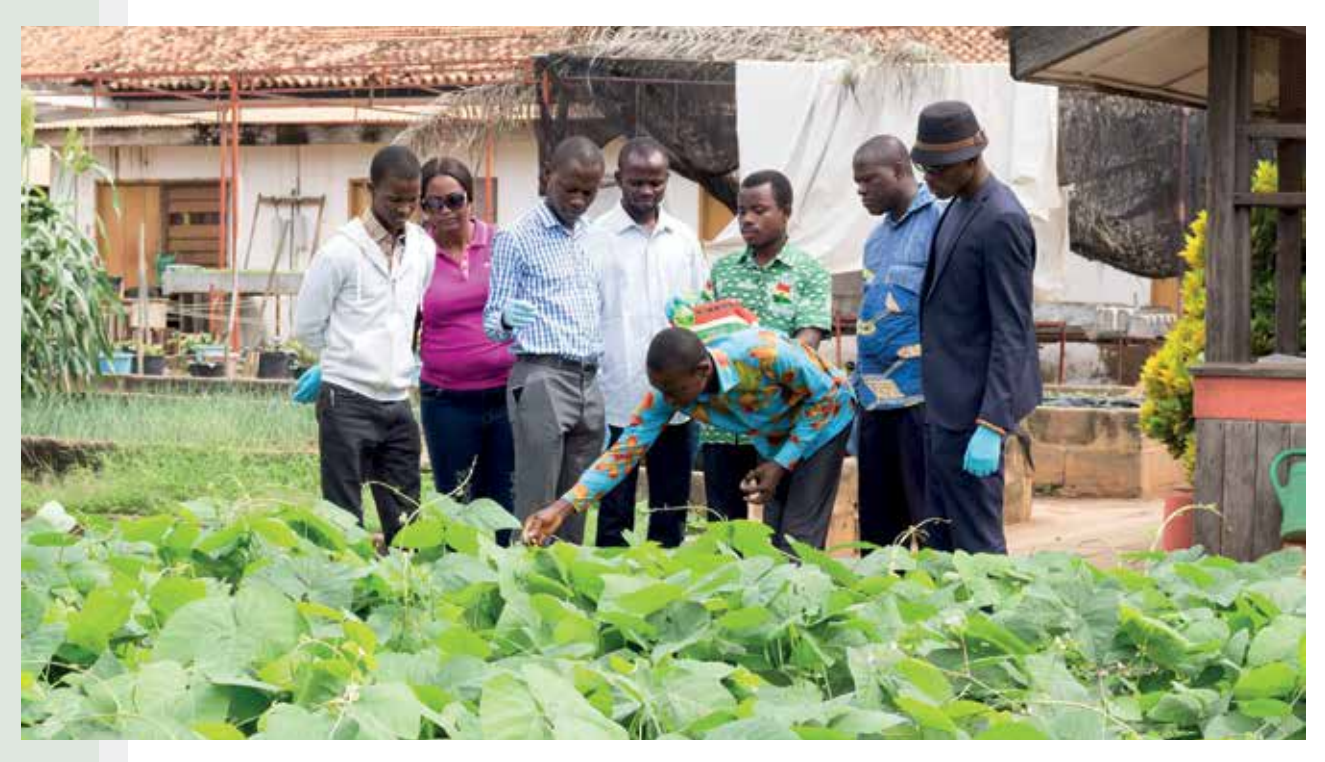
Journalists collect plant samples for DNA extraction outside University of Ghana at Legion biotechnology lab. The journalists were taken through the DNA extraction process at the university during the OFAB West Africa Regional Media Training in May 2017.