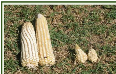
Maize cobs: IR maize (left) and non-IR maize harvested from the same Striga infested farm (Gospel Omany)

according to the World Health Organization, around 15 per cent of the population living in Striga infested regions are infected with HIV, thus depriving farm households of labour and leading to a further decline in crop yields. Labour cost and drudgery, especially for women associated with weeding prolific weeds such as Striga , only compounds an already serious situation for poor farming households.